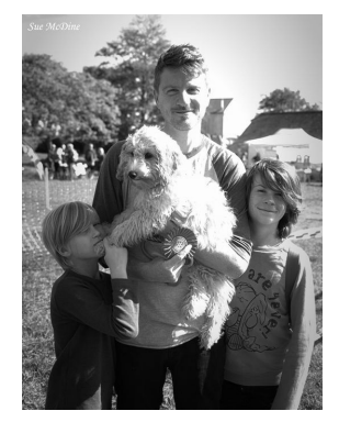
Semington hosted its first dog show.