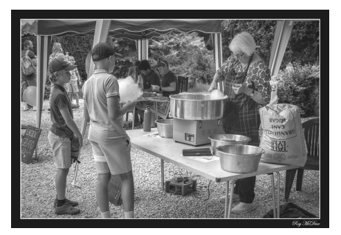
The Village Fete