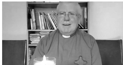
Leading worship via Zoom during Lockdown