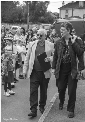
Crown judging duties