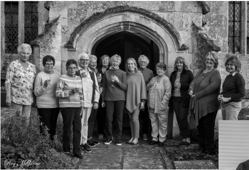
The lovely ladies who decorated the church so beautifully.

In closing, while it was such a lot of work to organise and coordinate, we eventually had dozens of people happy to help. The whole event should make us proud of our village. We know how to get stuck in and organise stuff and we know how to enjoy ourselves. Bring on the Summer Fete!