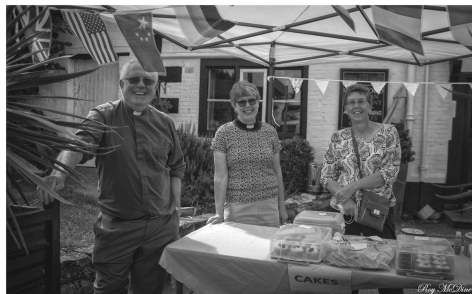
And cake duties at the fete!