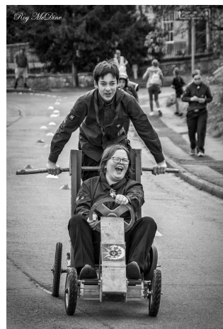
Unbridled fun and joy!