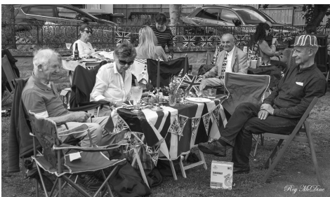
Picnic on the High Street