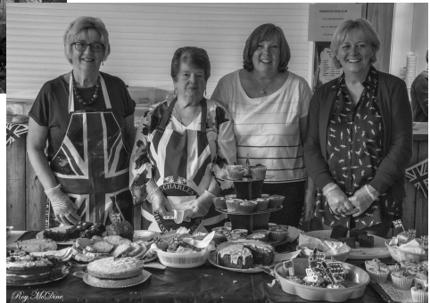
And the lovely ladies who made and served the cakes!